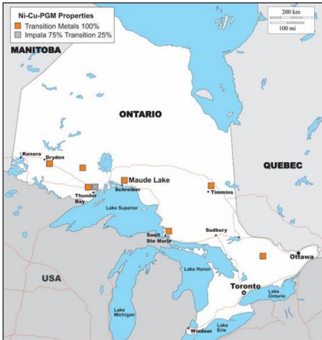
Figure 1: Location of the Maude Lake Property and Transition Metals Ni-Cu-PGM Projects

2) Ansell Lake Showing (Cu-Zn-Ag-Au): located on the eastern portion of the property and was exposed at surface in a series of eight historic trenches where an average assay of 1.06 % Cu was obtained from grab samples taken across a 14.3 metre wide trench. Interpretation of the survey data is ongoing to better understand the relationship between the conductive anomalies and the extent of the known mineralization for the purpose of expanded exploration targets